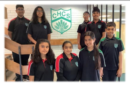
HPL Student Drive Team